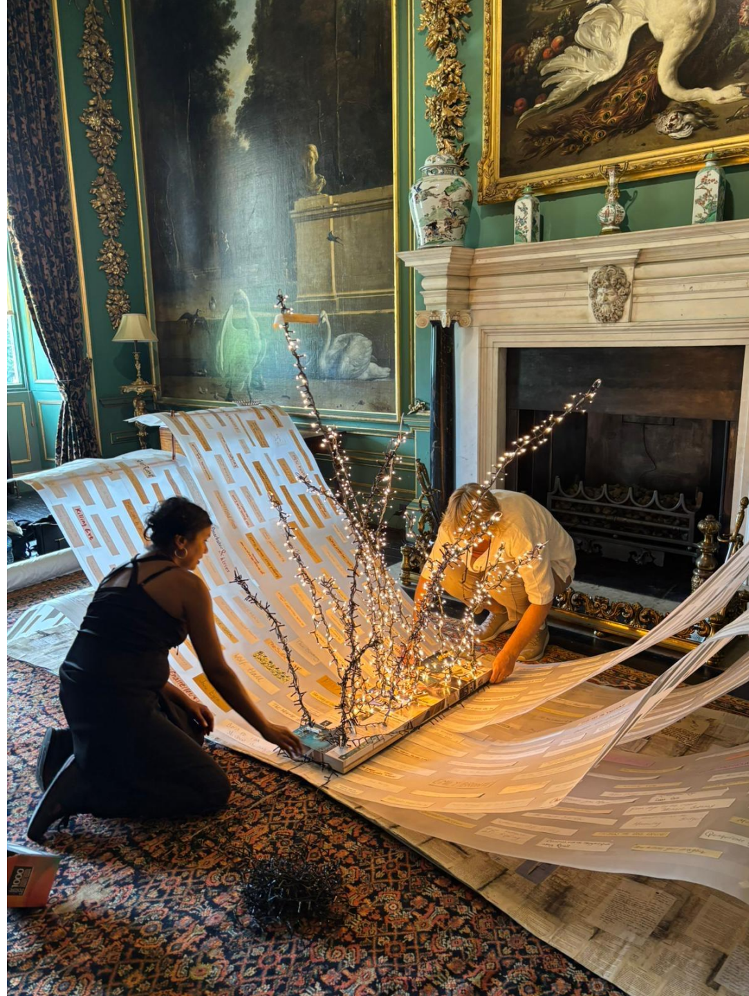
'Build a Book' Collaboration Belton House National Trust